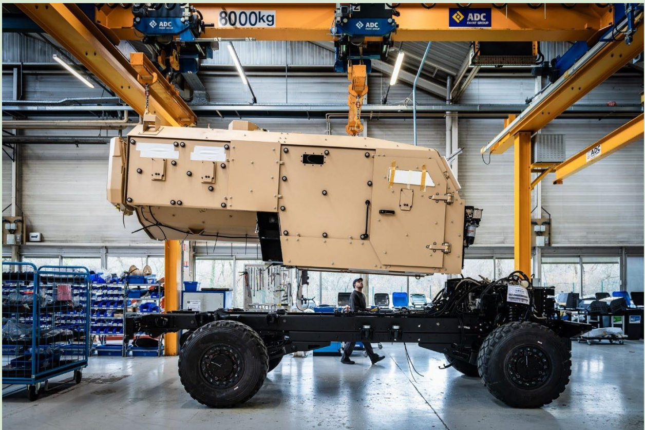
SHERPA assembly line, Arqus Limoges Centre of excellence

This type of partnership has already proven successful with iconic vehicles from the Arqus range, such as the SHERPA and the VAB. For example, in Indonesia, Arqus and PT Pindad have combined their technical expertise over the past ten years. Arqus has provided major mobility parts or components, such as powertrain groups or rolling chassis, for the local manufacturing of a 4x4 armored vehicle.