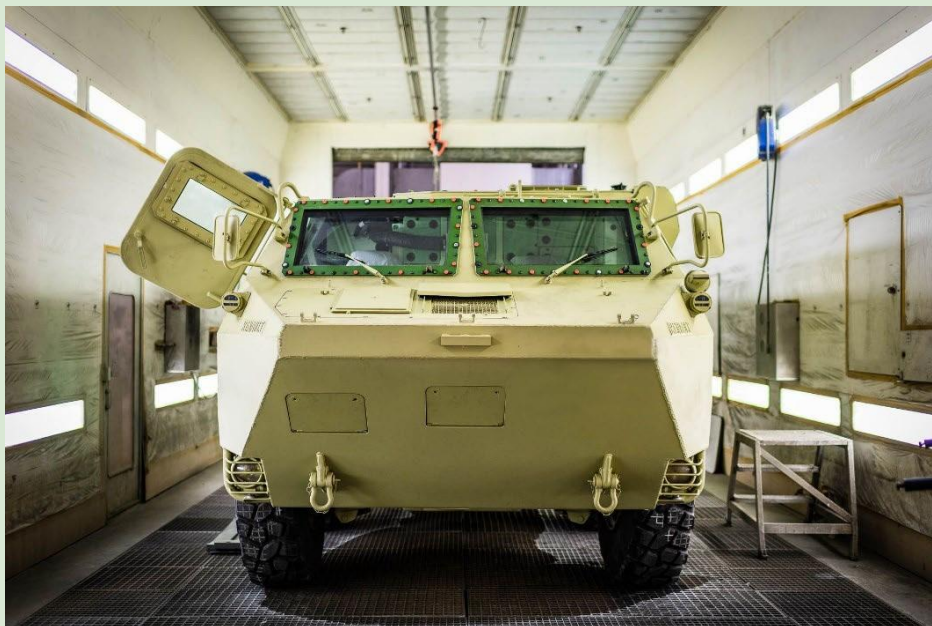
Paint booth – VAB MK3, Arquus Limoges Centre of excellence

With all these services, the vehicles maintain unparalleled and enhanced performance, perfectly adapted to various tension situations, considering geographical, financial, or geopolitical challenges. Arquus covers the entire tactical segment of wheeled armored vehicles, and all its platforms can integrate equipment and mission systems developed internally or by its partners.